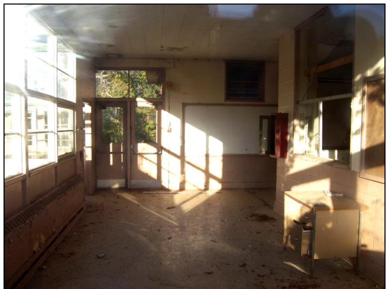
Figure 8. Silverstreet Elementary School, 1956 addition, Newberry County, South Carolina Photograph by Rebekah Dobrasko, 2007

As many of the equalization schools reach or surpass 50 years of age, district administration sees the buildings as outdated or in need of serious rehabilitation. Education architecture has changed dramatically in the past 50 years, requiring new schools to be sited on large tracts of land, usually on the outskirts of a community. Often, the equalization schools are abandoned in favor of new schools. Some are demolished or sit vacant while others find new uses. Brewer High School in Greenwood was converted for use as a community center, offices, and an after-school program center, while Silverstreet Elementary School in Newberry County sits vacant and deteriorating (Figure 8).