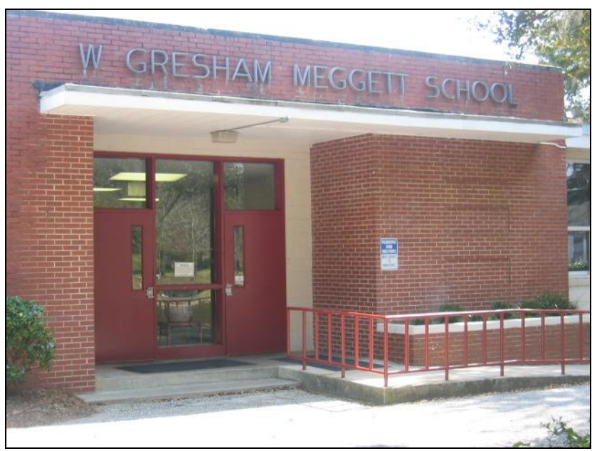
Figure 10. Original Signage for the W. Gresham Meggett High and Elementary School (black), now Septima Clark Corporate Academy, 1953, James Island, South Carolina Photograph by Rebekah Dobrasko, 2005

One of the biggest threats to equalization schools is a lack of knowledge or understanding of their history. The schools represent the culmination of a long history of segregated education in South Carolina, and are also indicative of the state's role in the landmark Brown v. Board of Education decision.<sup>27</sup> As school districts seek ways to upgrade their school plants, many of the 1950s schools are rehabilitated and lose their historic integrity. Other schools are abandoned and demolished in favor of new school buildings that represent the state of education in the twenty-first century. While not all equalization schools can be saved and reused, the surviving campuses serve as a physical reminder of both local and state educational, political, and racial history.