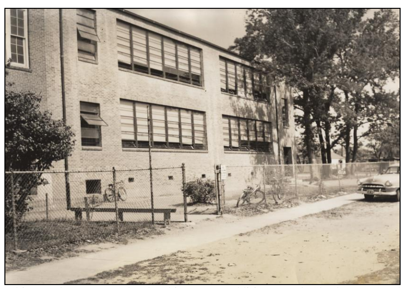
Figure 6. Chicora Elementary School (white), 1955 addition, North Charleston, South Carolina

The equalization schools were designed to take maximum advantage of air flow and natural light in the classrooms. Consequently, as schools began to install central air and heating, school districts viewed the walls of windows as energy deficient and began infilling the openings. School districts no longer wanted to financially maintain the large number of windows that were required as part of the postwar school. Many of the equalization schools may retain their historic window openings, but smaller windows have been installed and the larger window openings filled with brick, concrete block, or wood (Figure 7).