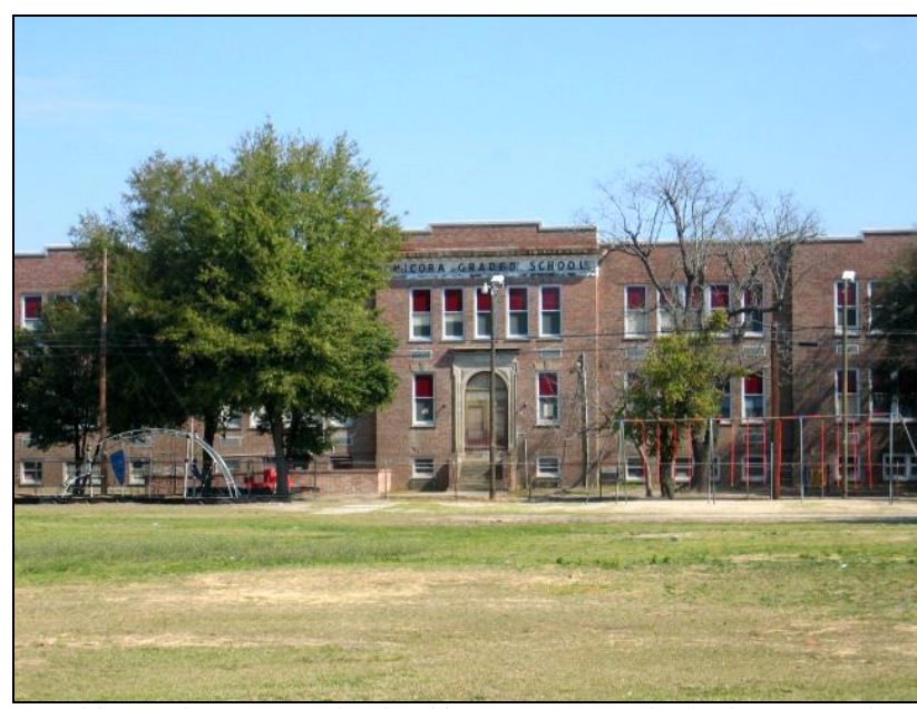
Figure 5. Chicora Elementary School (white), c.1920, North Charleston, South Carolina Photograph by Rebekah Dobrasko, 2005