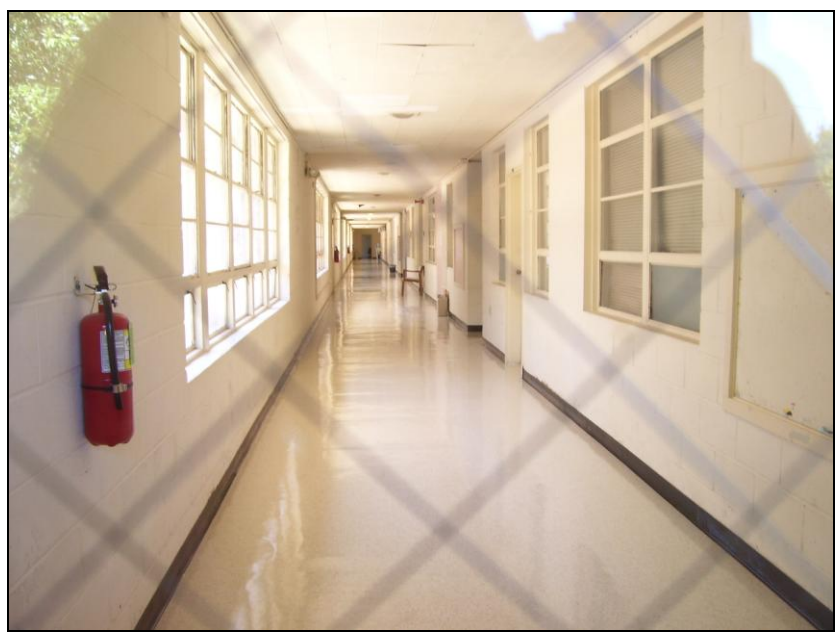
Figure 2. Florence Benson Elementary School (black), c. 1954, Columbia, South Carolina

Changes in secondary school curricula and education led to changes in high school layouts after World War II. Many high schools began to offer specialized vocational and academic training to prepare students for college or for the workforce. School districts began to offer agricultural classes, home economics, and specialized science classes, which required specific classrooms with particular equipment. The "campus plan" emerged as a response to this new curriculum. Schools constructed on the campus plan consisted of several different buildings dedicated to different courses and specializations (Figure 3). <sup>19</sup>