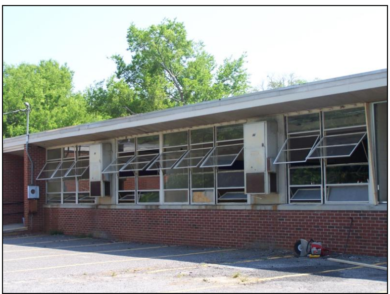
Figure 4. Central Elementary School (white), 1957, Lancaster, South Carolina

The new schools took advantage of innovative materials and technologies developed during World War II. Most new schools were constructed of concrete frames with brick veneer. In Charleston County, many of the new schools had cast stone entryways, which is a characteristic of the equalization program.<sup>24</sup> Metal windows, typically aluminum, were used in the majority of the schools across the state to provide lighting to classrooms as well as ventilation. The metal windows reflected the technological developments that showed South Carolina's equalization schools as modern and efficient for both black and white students (Figure 4).